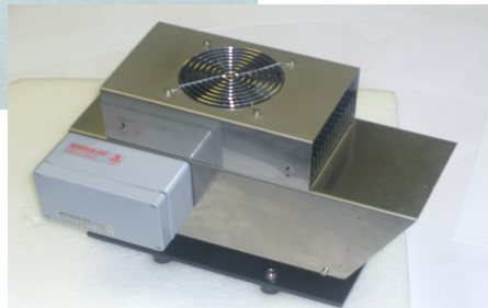
Peltier Cooled Laser for High Ambient